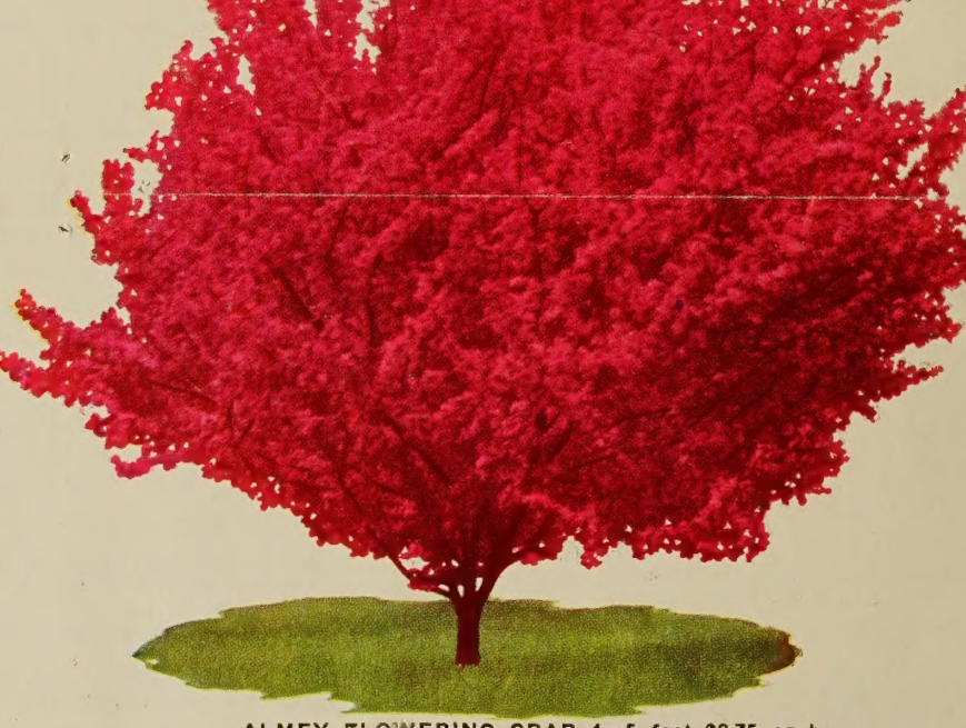
ALMEY FLOWERING CRAB 4-5 feet $2,75 each.